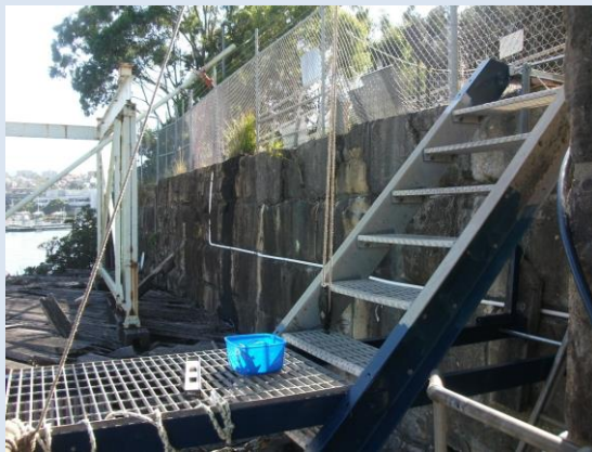
Treads securely bolted and level