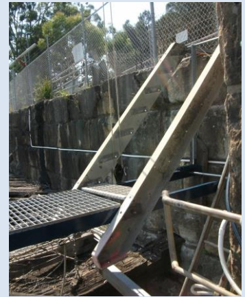
Stair treads at a sloping angle

My apologies to all who may find this long winded script a little but tedious such is the dedication of the crew in somewhat trying conditions that every step achieved needs to be reported to the wider Cape Don community in full. Peter