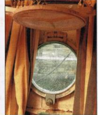
A porthole on the MV Cape Don and one of the restored lifebuoys, below.