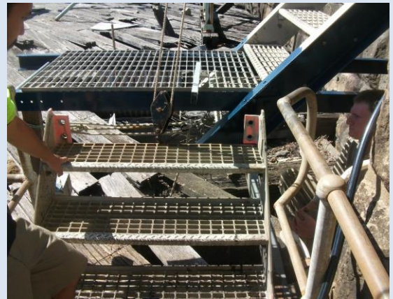
Test fit lower stairs