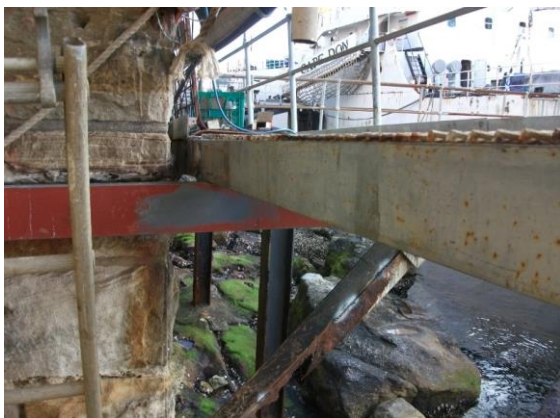
Repairs to the cat walk supports