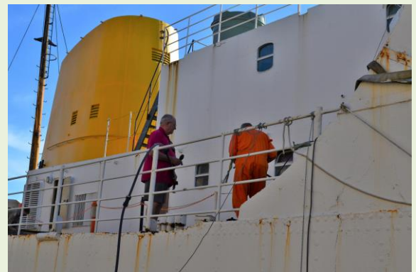
John & Brian working on the water supply

Most of the weekend was spent on protecting and securing the mains cable near the new stairs. Planning work for the ships and gate entrance security, emergency lighting and lighting for the new access area. Paul checked the anodes and reported that the new larger anodes are working well. Saturday afternoon was spent cleaning out the steel conduit store to see what stocks of fittings we have as some will be required to upgrade the remaining emergency lights and security systems. Warwick