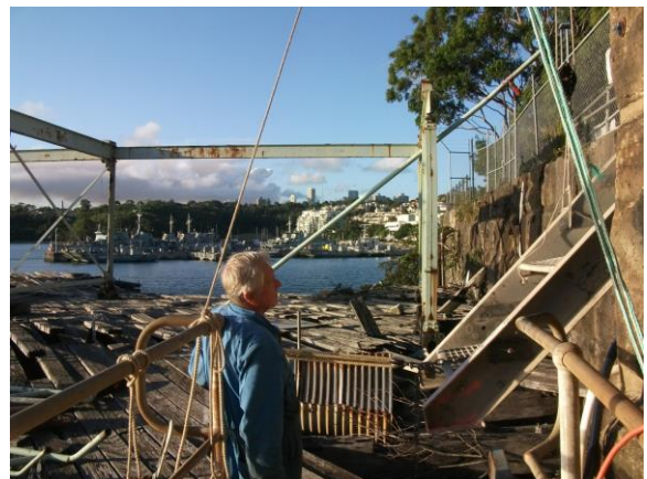
Warwick checking the stringers