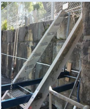
Stringers in place

Friday the 4 th of March saw Warwick Whalley on the scene and spend the greater part of the day on the lathe cutting threads into each end of the 20mm stainless bar - by hand turning of the chuck - no mean feat let me assure you! Friday afternoon was a stinker of about 34° and 90% humidity but with Daniel Callender's assistance we managed to lift the stringers into the horizontal position and locate them with the stainless rods on their proper hanging points. We finished the day at about 18.30 by placing two stair treads and bolting them in place.